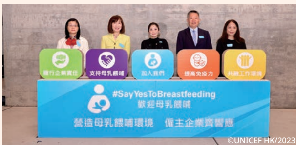
Group Photo of the Officiating Guests of 'Say Yes To Breastfeeding' Acknowledgment Ceremony 參與「Say Yes To Breastfeeding 嘉許禮」的主禮嘉賓合影

UNICEF HK、明報出版社和愛嬰醫院香港協會於2023年4月14日共同舉辦了「Say Yes To Breastfeeding 企業培訓講座」，邀請專家為企業提供母乳餵哺專業知識和相關法律資訊，旨在幫助企業輕鬆地營造母乳餵哺友善環境。