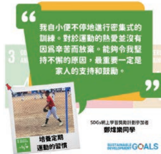
SDG 3: Cultivate the Habit of Regular Exercise SDG 3: 培養定期運動的習慣