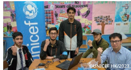
Action Team: Development Group

他們於饒宗頤文化館舉行的「SDG行動派」少數族裔青年教育計劃嘉許禮活動中更發揮創意,策劃低碳主題攤位活動,並向到場的嘉賓和市民展示校園種植、課室慳電裝置以及二手衣物升級再造等倡議及成果。部份計劃參與者亦出席了在油塘大本型商場舉行的「SDG行動派計劃成果展」,向在場公眾人士進行講解及互動交流。