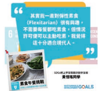
SDG 6: Vegetarian Lunch Challenge SDG 6: 素食午餐挑戰