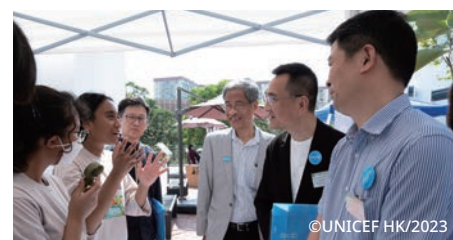
SDG Actioners showcased their creative ideas at Jao Tsung-I Academy. 「SDG行動派」於饒宗頤文化館展示創意成果。