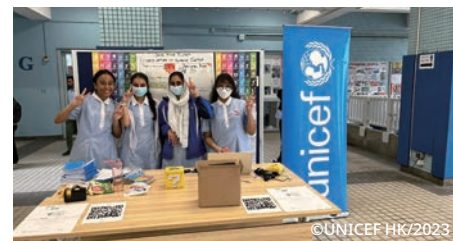
Action Team: Education Booth