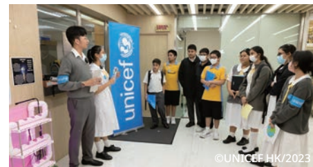
Action Team: Global Greenhouse