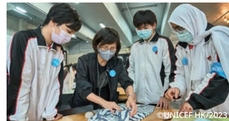
Action Team: Sustainable Future