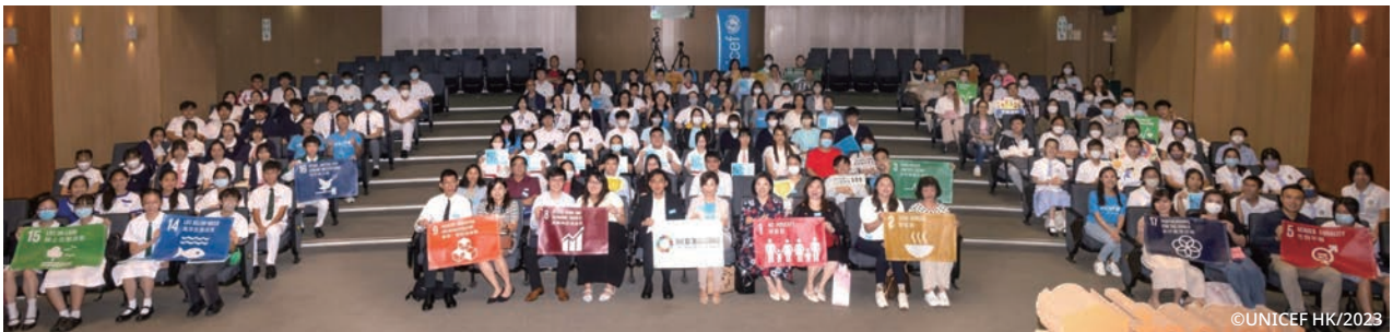
SDGs eLearn Award Scheme 2023 Prize-Presentation Ceremony 可持續發展目標網上學習獎勵計劃2023頒獎禮

今個學年計劃反應熱烈，獲7,500位來自93間學校的學生報名參加，報名人數較上屆激增3倍，合共完成了5,060項SDGs課程及行動。UNICEF HK將再接再厲，繼續透過教育工作讓更多年青人認識SDGs，為我們的下一代延續可持續的未來。