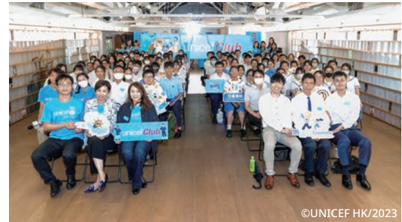
UNICEF Club Appreciation Ceremony 2022/23 UNICEF Club嘉許禮2022/23

超過15,000名同學及師長了解到世界各地的兒童狀況、UNICEF的工作和有關兒童權利及聯合國可持續發展目標的知識。