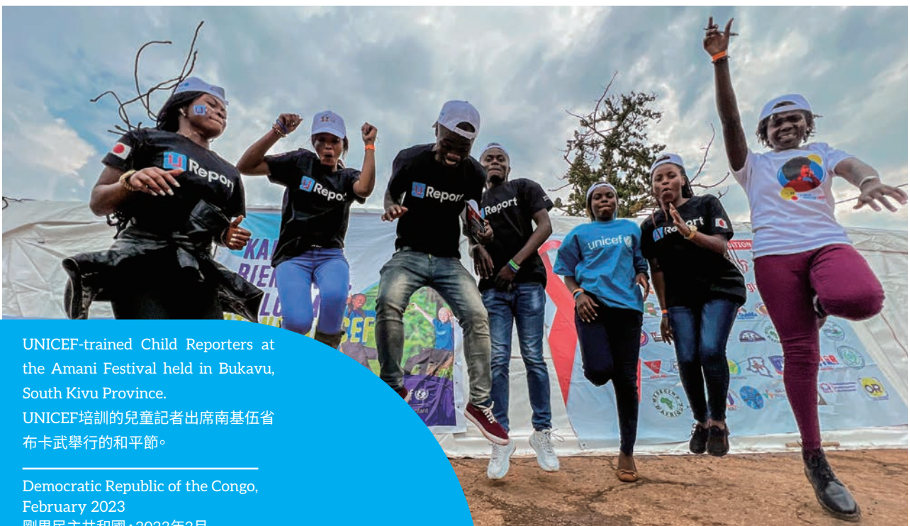
UNICEF-trained Child Reporters at the Amani Festival held in Bukavu, South Kivu Province.

為聯合國氣候變化大會COP28舉辦的氣候調查收到了來自59個平台的77萬份回覆，年輕人的聲音被納入COP28官方青年聲明。