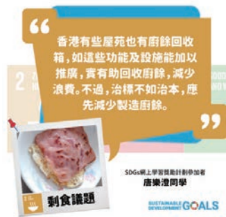
SDG 2: Leftover Food SDG 2: 剩食議題